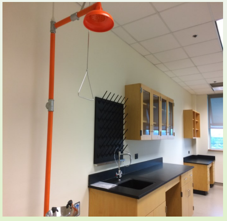
NCF 273—NCF Organic Chemistry Research Lab work desk space/book shelves