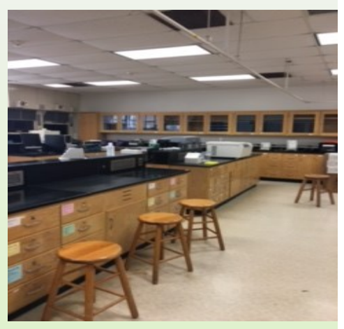
NCF 316—NCF Biochemistry Teaching Lab