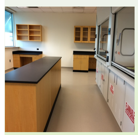
NCF 273—NCF Organic Chemistry Research Lab Fume Hoods