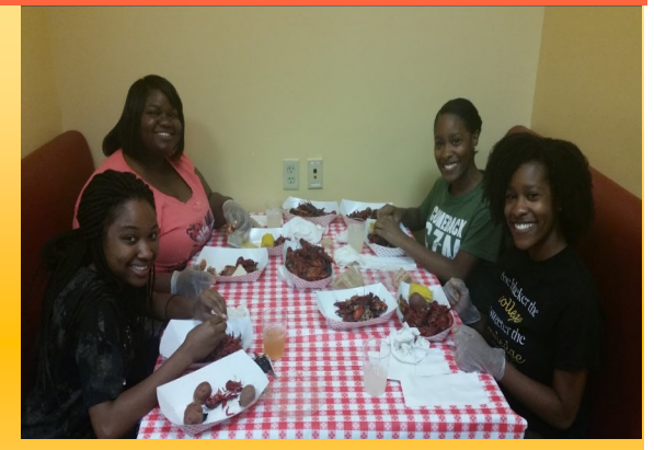
New Orleans is known for its festive spirit and, in keeping with tradition, CUR hosted a crawfish boil for the students and faculty doing research at Xavier during the summer.