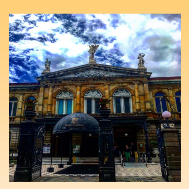
San Jose, Costa Rica