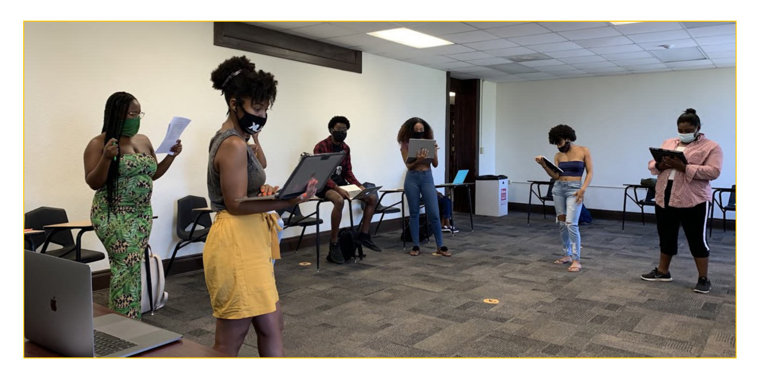
French 3011 - Advanced Conversation