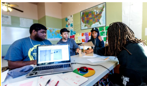
Student from Net Charter High School during the design phase

Students used the Business Model Canvas to explore the feasibility, identify customers and determine the value proposition of street furniture. The students identified 20 possible customer and after conducting interviews they narrowed the pool to three: Regional Transit Authority (RTA), The City of New Orleans, and parks. They determined that RTA was the most attractive, because of the need for bus stop shelters (a type of street furniture) and their strong interest to exhibit New Orleans culture as well as patronize local businesses. The solution to the problem was to organize a company that will market the products of Youth Solutions. A feasibility study was completed and delivered to sales executives at 3M as well as other universities that participate in the SSI Program. The presentation was very well received, so much so that 3M referred the team to one of their New Orleans sales representatives for assistance.