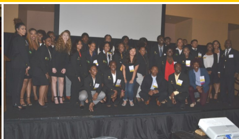
XULABusiness students that earned a covenant spot on the Dean's list during this year's annual awards banquet