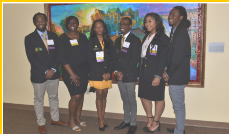
Students pose for a photo during the network reception at this year's annual awards banquet