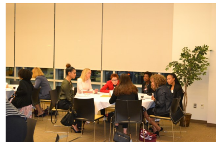
Students in round 2 of speed networking