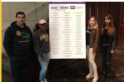
Students pose for a photo at the Value & Venture competition