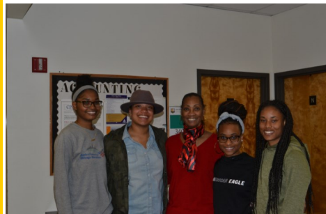
XULABusiness students enrolled in advance tax accounting pose with client after tax preparation at the division's VITA site