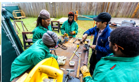
Student from Net Charter High School during the Production phase