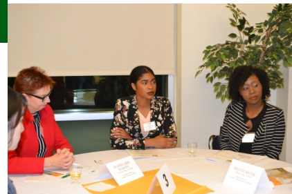
Students share and listen to experiences of women business leaders during speed networking