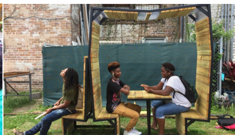
Student from Net Charter High School admiring the final product