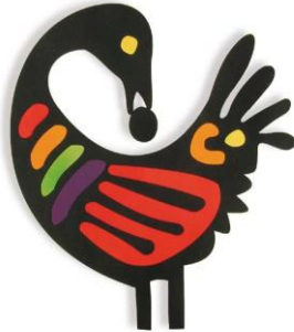
SANKOFA "go back to fetch it"