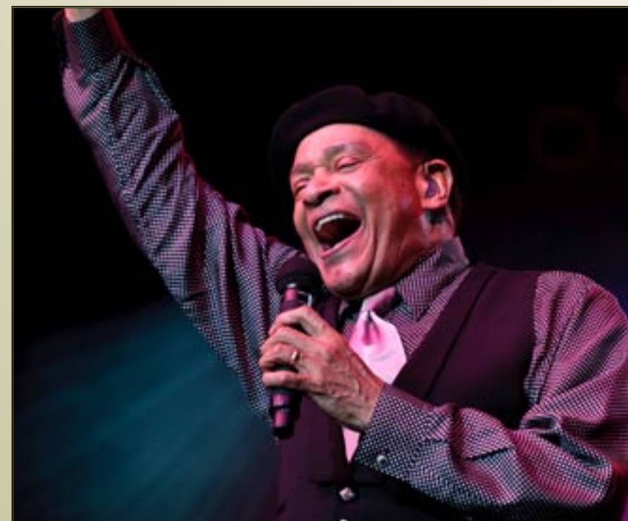
Al Jarreau performing.